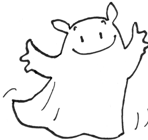
4. Add face, movement and ground.