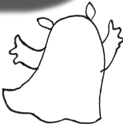
2. Add arms and ears.