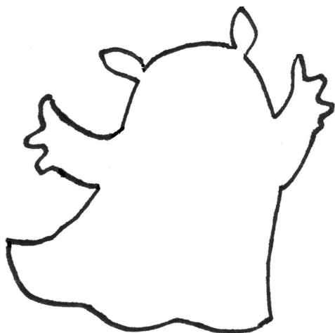
3. Erase overlap lines.