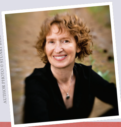
AUTHOR PHOTO © STUART BISH