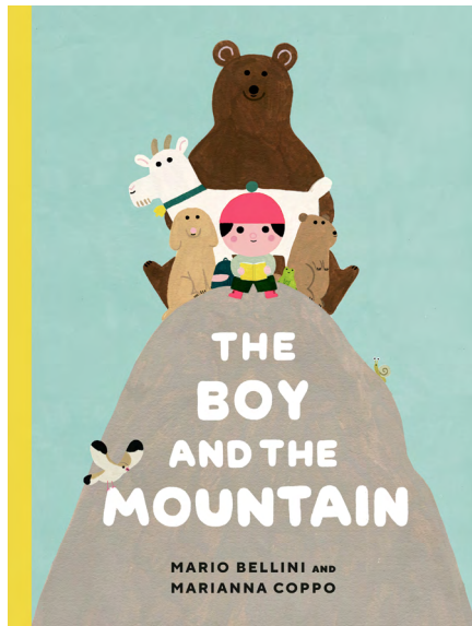
Hardcover | ISBN 9780735270251 | 48 Pages Age: 3-7 years | Grade: Preschool-Grade 2